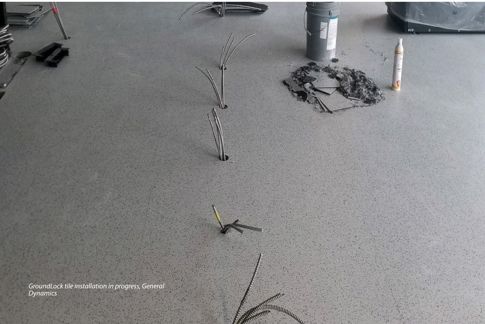
GroundLock tile installation in progress, General Dynamics