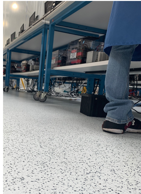
GroundLock Extreme installed at Advanced Motion Controls Notice tight, invisible seams.