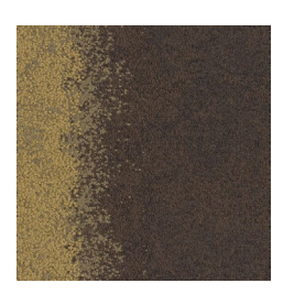
Fields & Stone: Savanna and Serpentine