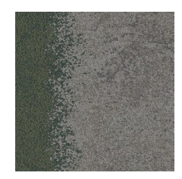
Fields & Stone: Tourmaline Fields & Stone: Savanna and Pasture