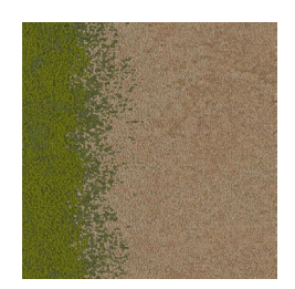
Fields & Stone: Sandstone and Meadow