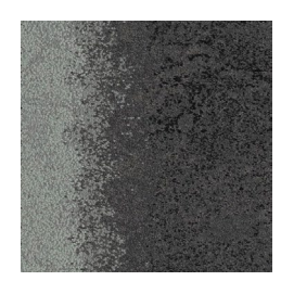
Fields & Stone: Coastal Plain and Anthracite