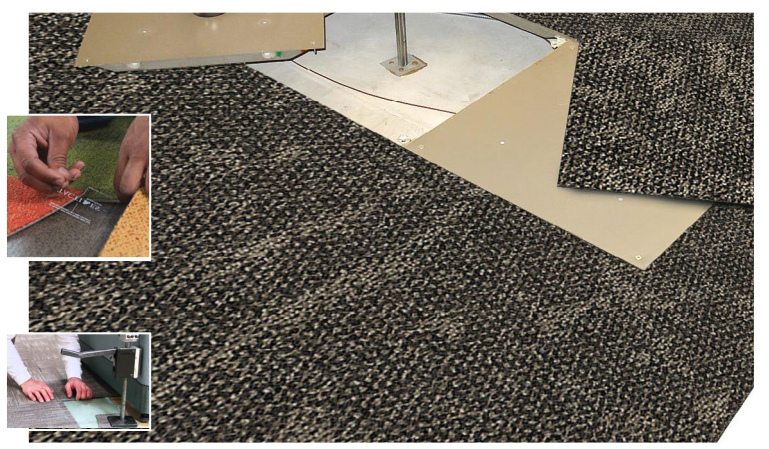
Floating ShadowFX carpet tile installed over access flooring