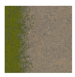
Fields & Stone: Quartz and Meadow