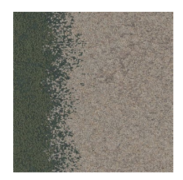
Fields & Stone: Pasture and Shale

ShadowFX ESD carpet tile is made by an industry leader in the development of flooring made using recycled materials and 100% Carbon Neutral for the total life cycle.