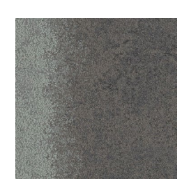
Fields & Stone: Coastal Plain and Granite